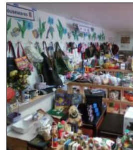
We are a family. Together, we build a school: installing play structure, car wash, read-a-thon and rummage sale.

As presented this past August at a community meeting, while a full-time tuition is $12,750 , the true cost of educating each child is $14,200 . Every year, the gap between tuition and true cost is made up by fundraising vigorously throughout the year. You can help us by participating in our school fundraising events: The Hong Bao Auction Gala, Family Bowling Tournament and Rummage Sale to name a few.