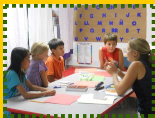
Fourth grade Spanish with Professora.

More photos online. "Like us" on Facebook.