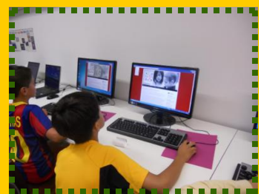
Students at the new computer lab.