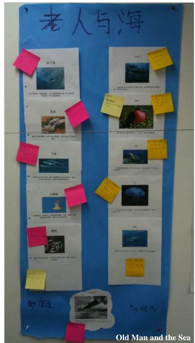
Old Man and the Sea

Oh..... one more thing. If you think there are only two students in 6 th grade class, it's no longer accurate. We have our student #3, a guinea pig! Her name is XiXi (Cici in English). XiXi says hi to the NWCA community.