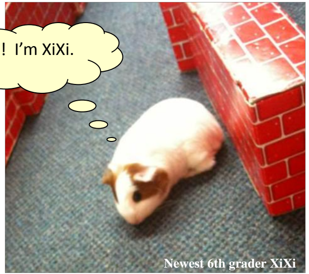
Newest 6th grader XiXi