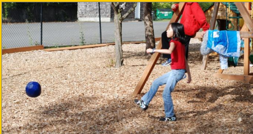
Photos from recess time.