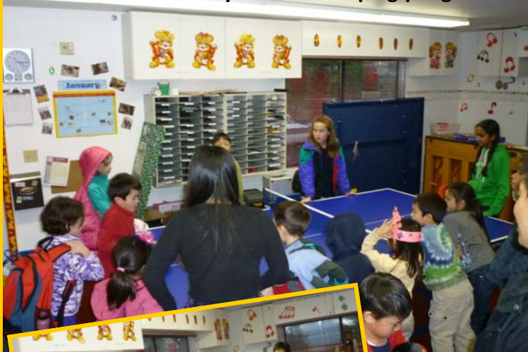
Students excited to try out the new ping-pong tables